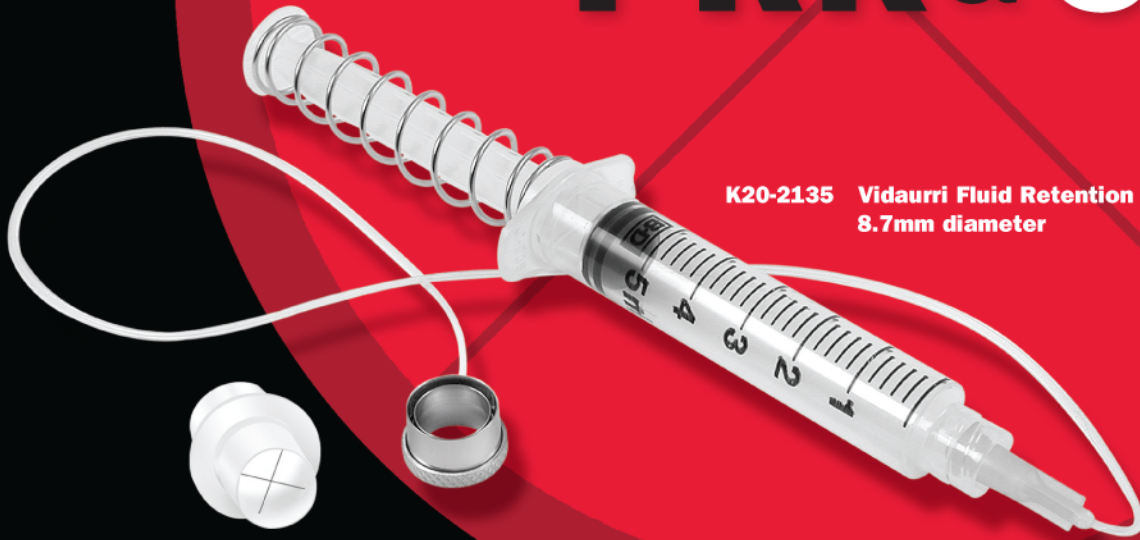
K20-2135 Vidaurri Fluid Retention Ring, 8.7mm diameter