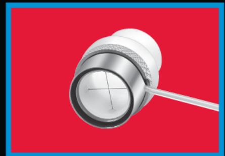
cross-hairs for centration